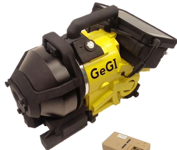
2590 300 W-hr External battery