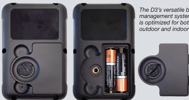
The D3's versatile battery management system is optimized for both outdoor and indoor use

The D3 PRD can be easily integrated into a central sensor hub, or combined sensor platform via USB or Bluetooth. This enables a single control point for multiple integrated sensors, rather than using each one individually. The alarm and dose is given as an output by the detector.