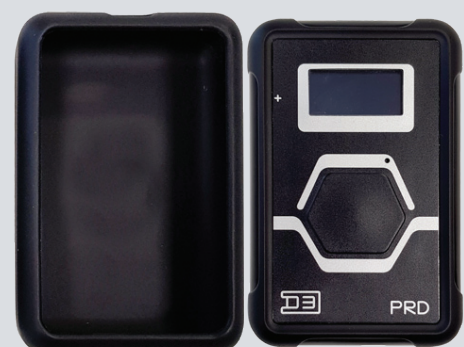
Protective sleeves provide enhanced grip and additional drop protection